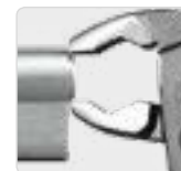
Plug pulling protection